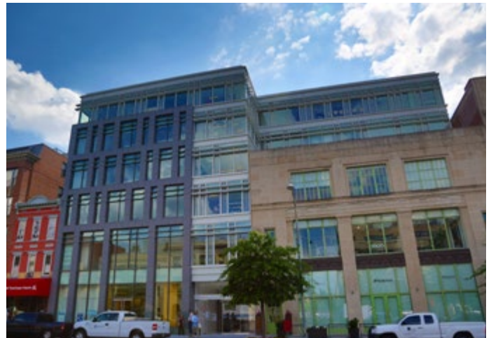
▲ Visit us at our state-of-the-art medical home at 1525 14th Street, NW.

Whitman-Walker provides gender affirming services, including hormones, to minors ages 13 and over. Minors must have parental consent to receive primary medical care and gender affirming hormones.